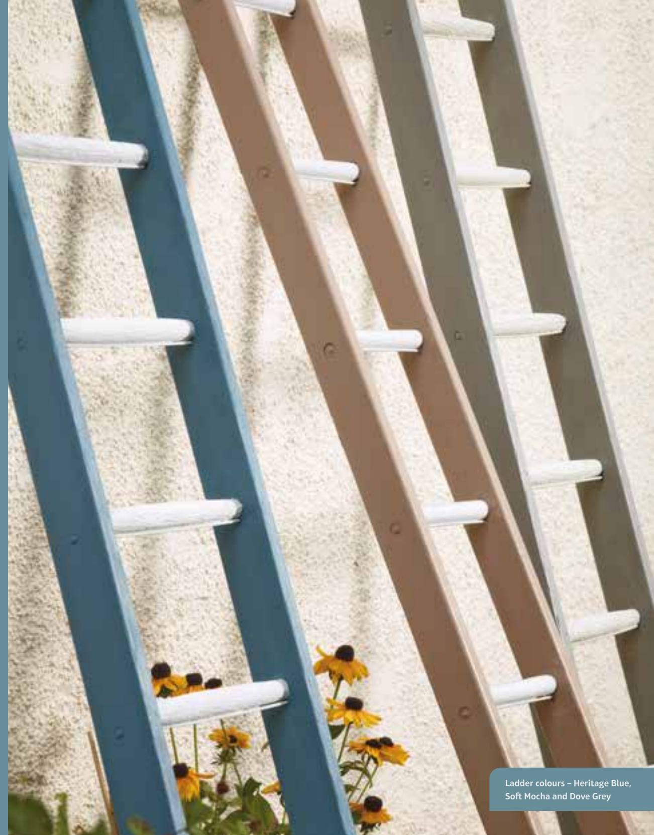
Ladder colours – Heritage Blue, Soft Mocha and Dove Grey

Varnish (water based polyurethane breathable products are preferable) – apply on top of interior coatings that will be subjected to high levels of wear and tear such as floorboards, table tops and kitchen work surfaces.